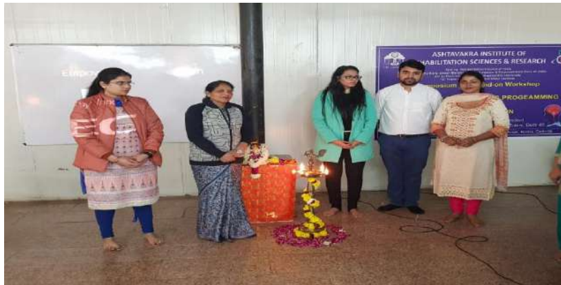
Fig 1: Lamp Lightning