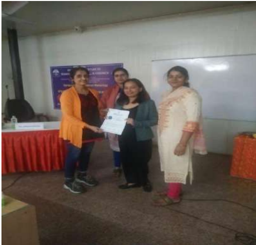
Fig 8: Felicitation of Ms. Phenex