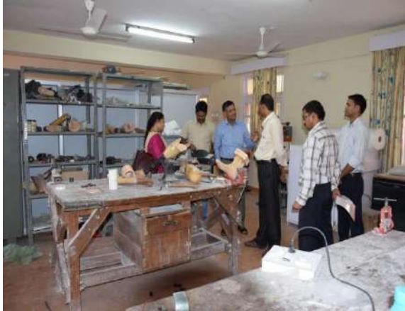
Activities at Centre with special Children