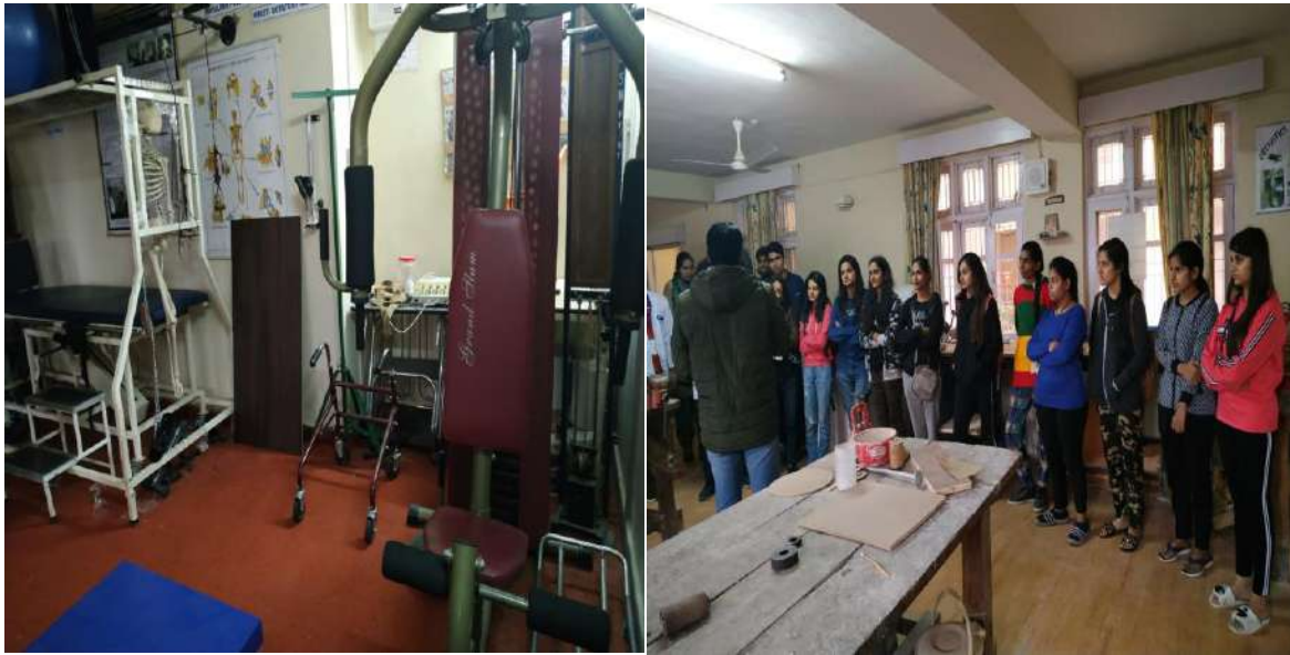
Students viewing new Application Devices