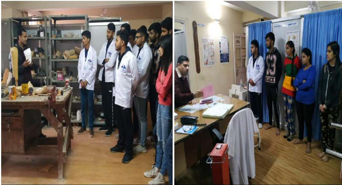
Orthotics and Prosthetics Dept.