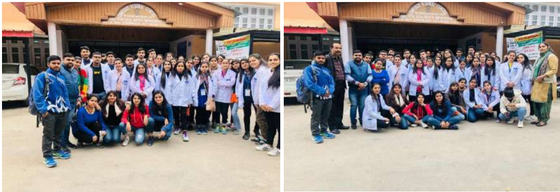
Group Photo of the students at CRC