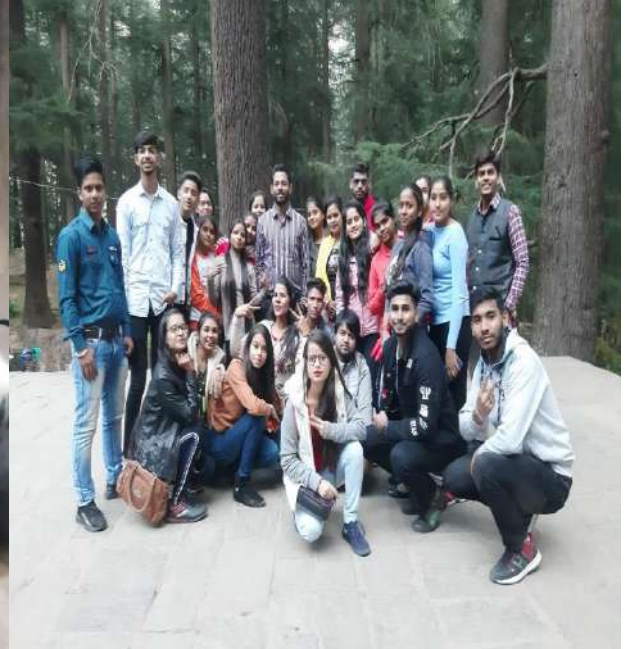
Glimpses of Students at Hidamba and Vashishtha temple.

At night the students relished the dinner followed by DJ Night at Moniker Resort.