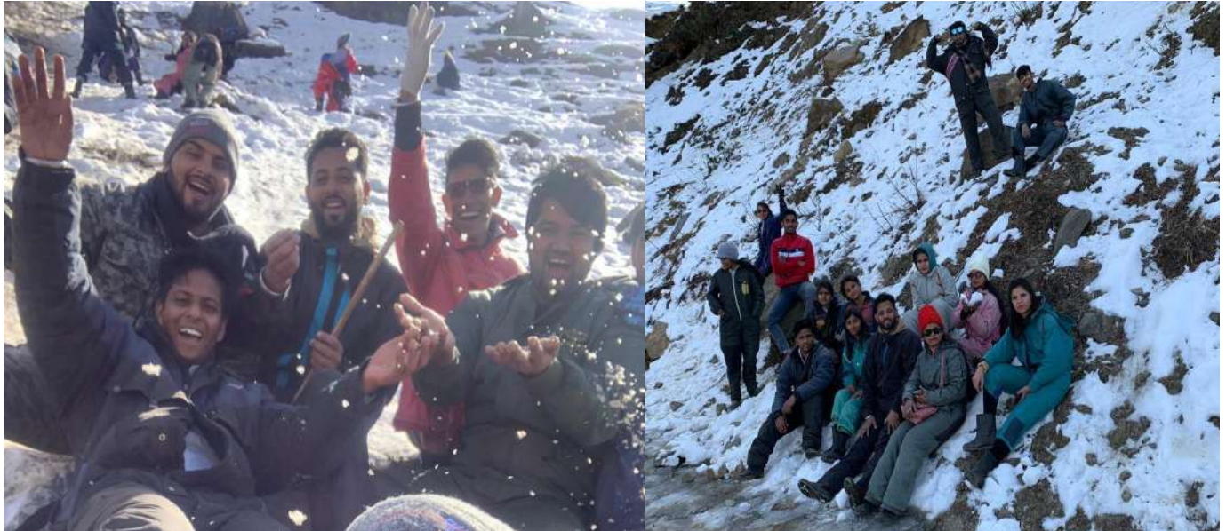
Glimpses of Gulaba Snow Point

On the third day the students relished breakfast, after which they got ready for Gulaba Snow Point and enjoyed the snow.