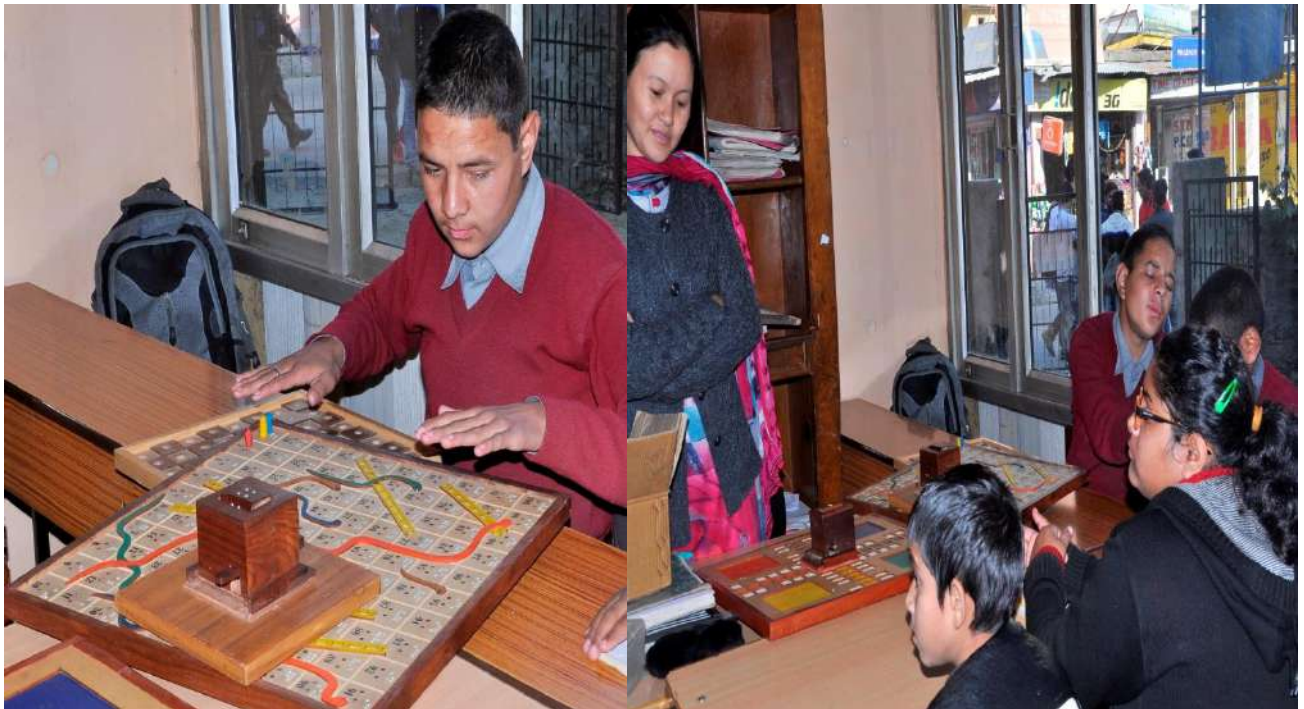
Students learned the functioning of Play Group

After Completion of Educational Visit the students proceeded to Moniker Resort.. After Lunch the students got ready for Hadimba temple & Vashishtha temple. After Spiritual Touch the Students went to Mall Road for Shopping.