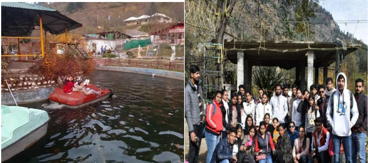
Glimpses of water Activates at Camp

Thereafter the students had lunch at Camp. After Lunch got ready for adventurous activities like Cable car, Water roller, Rope leader, Bonfire, Zip-Line etc