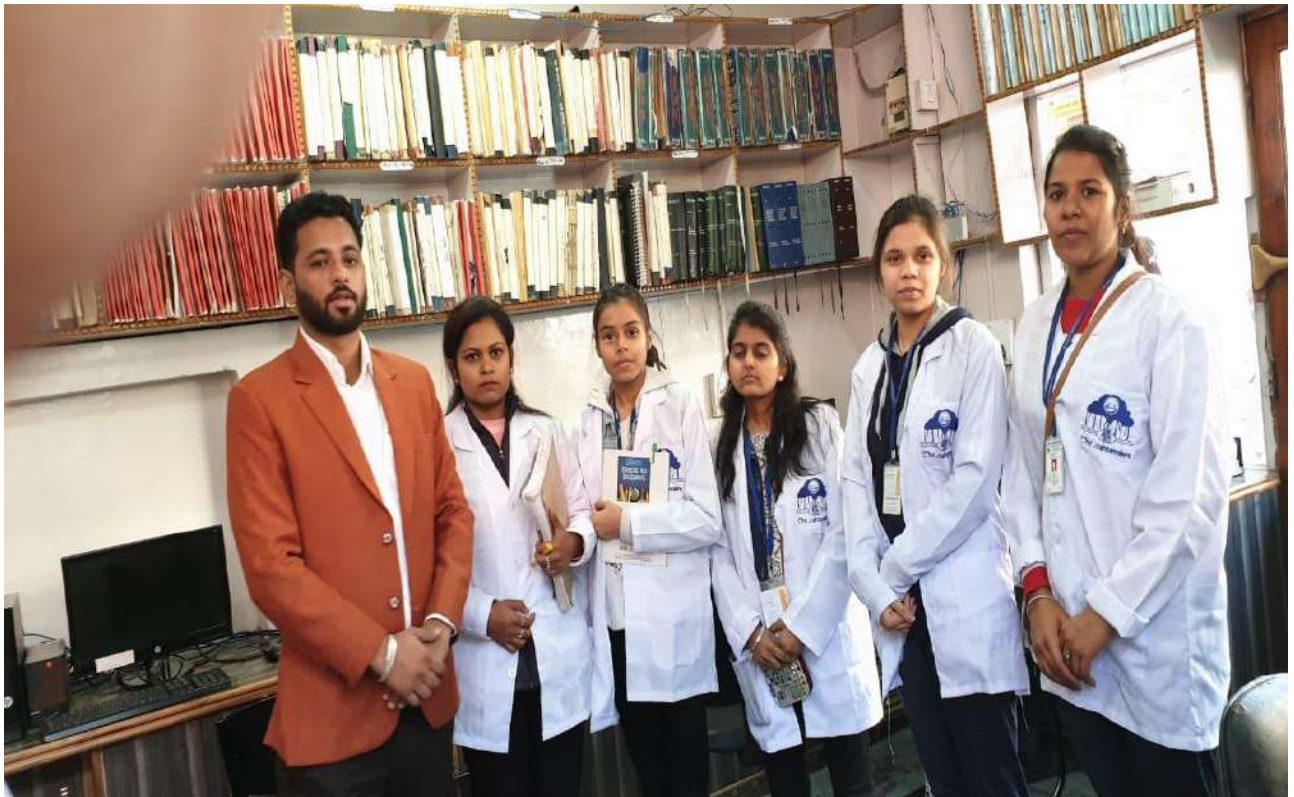
Students learning the library set up for children with Deafblindness