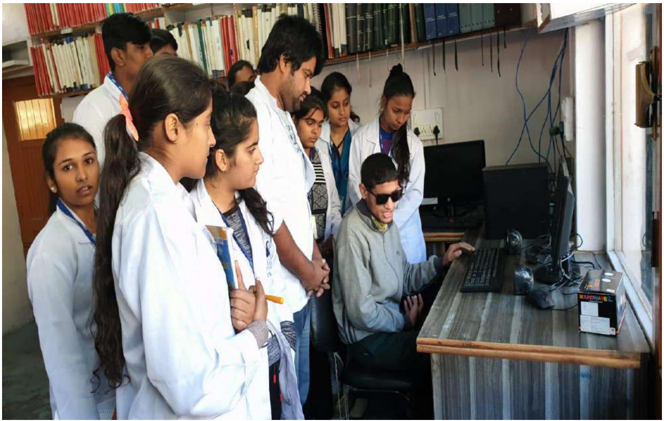
Students learning use of ICT for children with DB