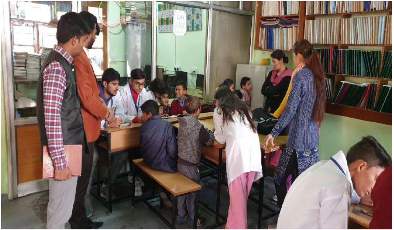
Students practically learned the working of Functional Academic Group