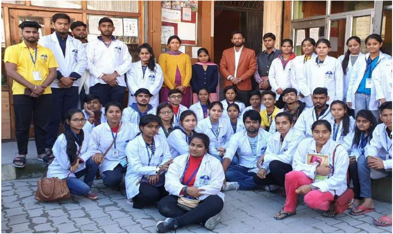
Group Photo of the students at NAB