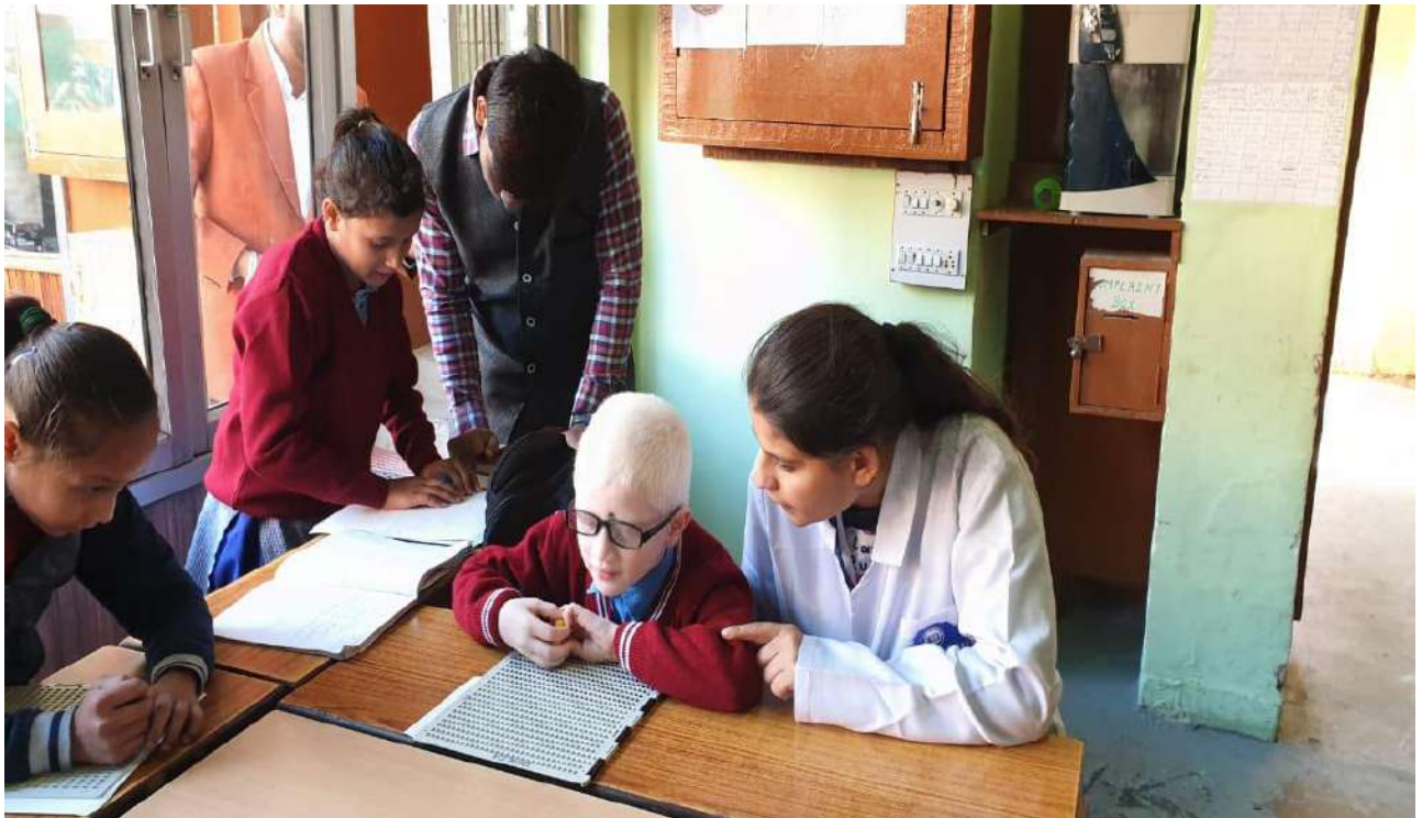
Hands on Experience in teaching Early Group of CWSN