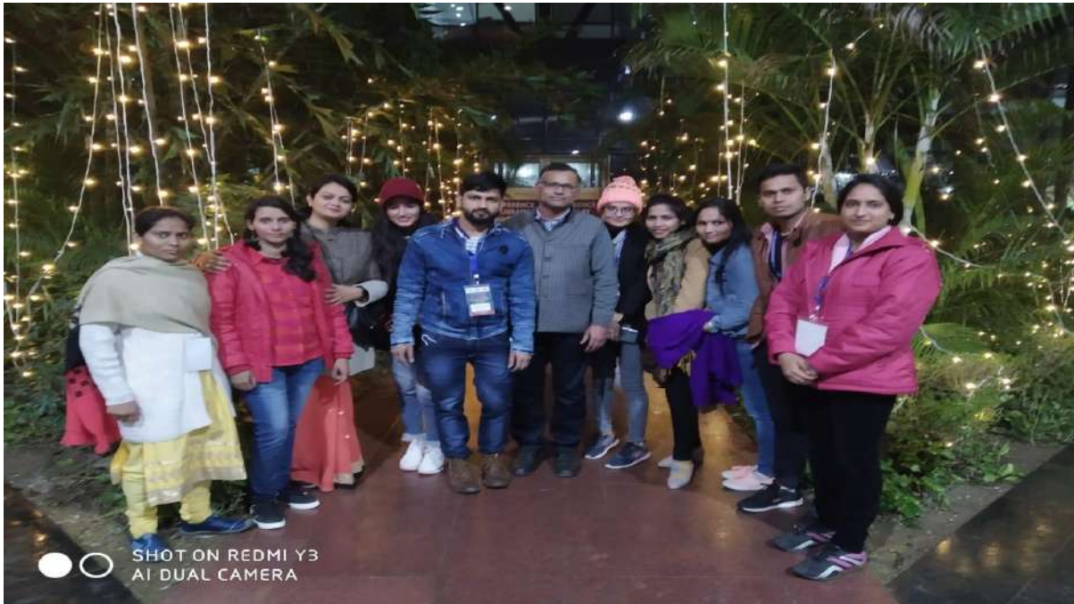
Students with staff members

After conference the students enjoyed the culture programme , thereafter they relished the dinner followed by DJ Night (GALA Diner) in which they tapped their feet on the melodious music and enjoyed. The students enjoyed the folk dance and dhol with the artists and had nice time.