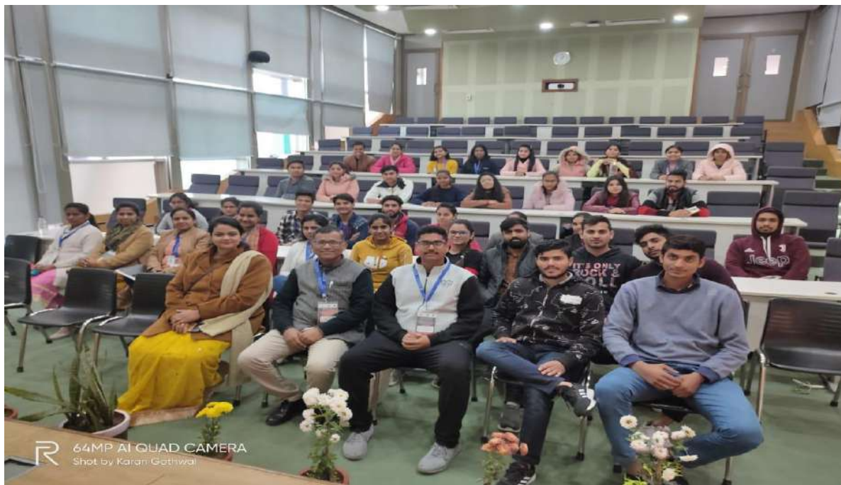
Group photo in OPJGU Conference Hall (AIRSR Faculty and Students)