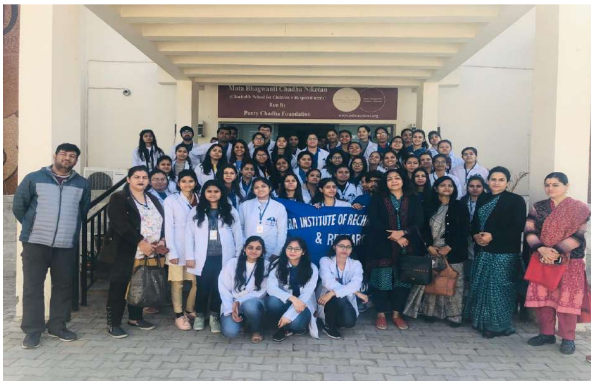
Group Photograph of the students and Faculty members