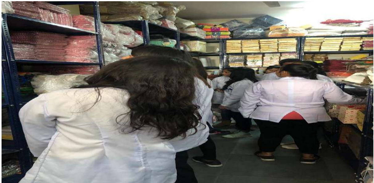
Glimpses of Stock prepared by Specially abled students