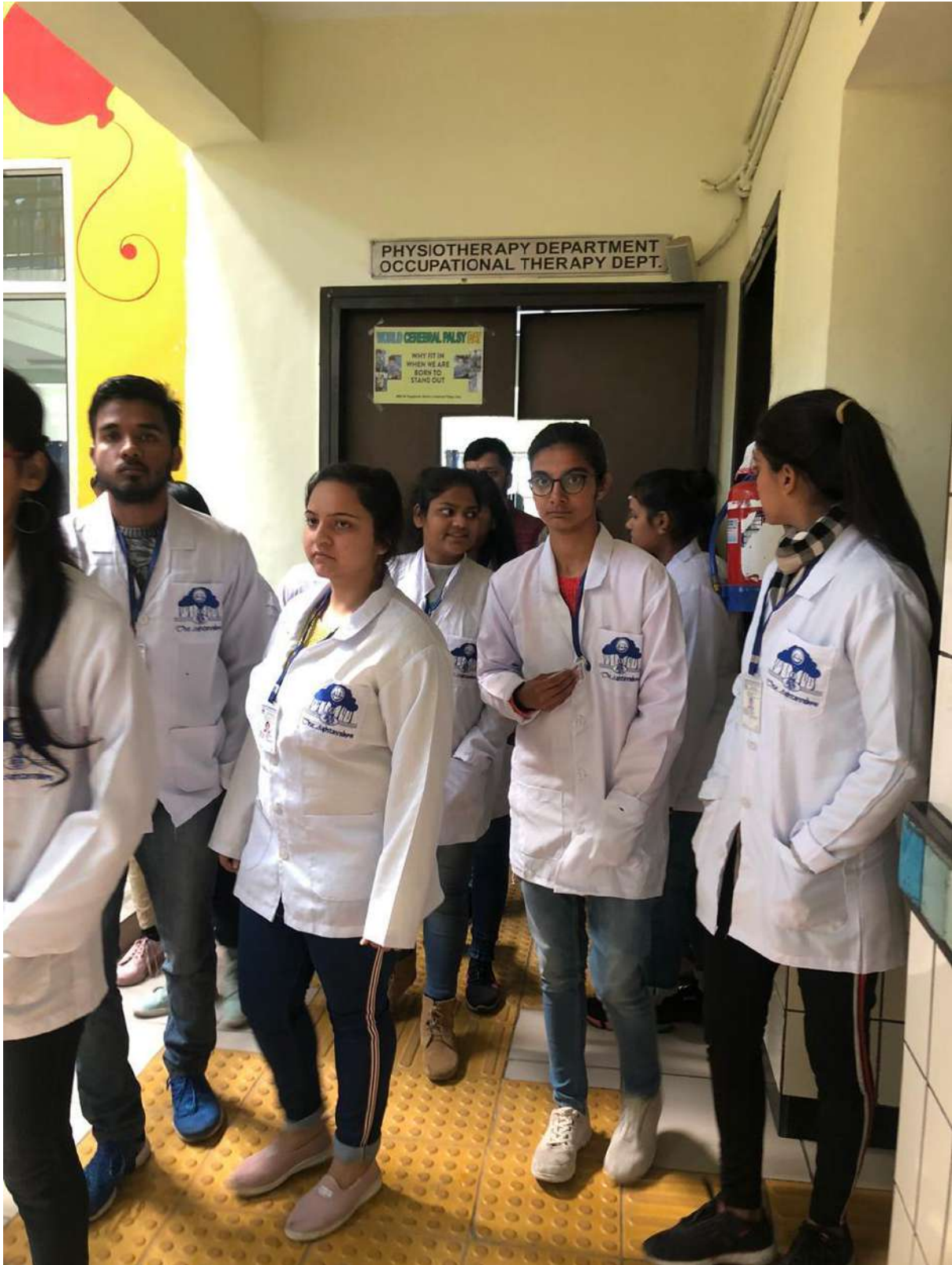
Visit to OT/PT Room of MBCN by students of AIRSR