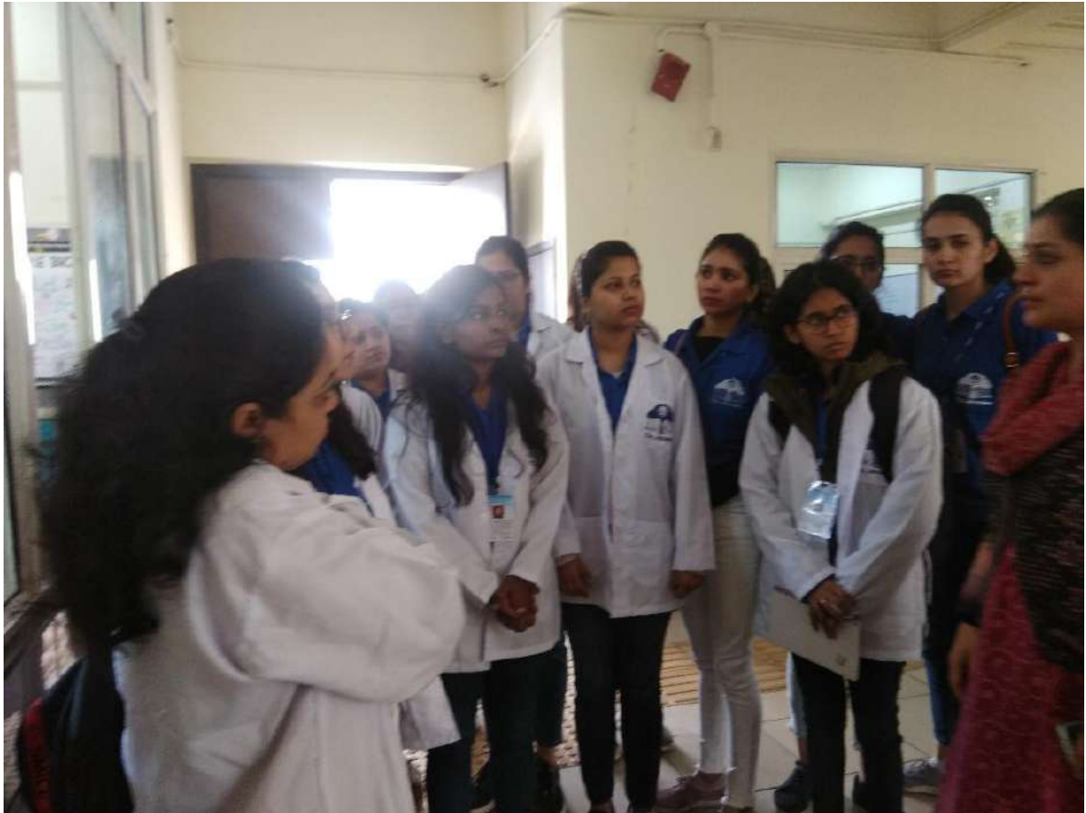
Briefing about vocational setup at MBCN