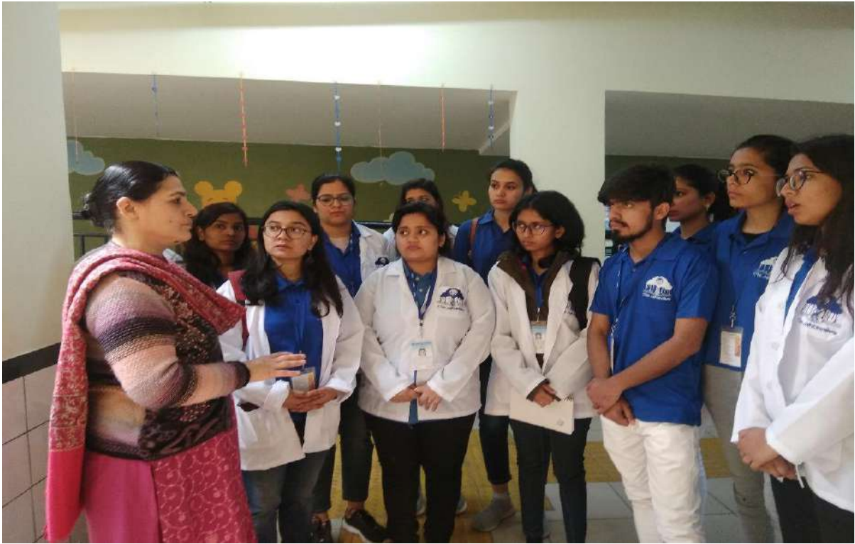
Special Educator at MBCN ,Explaining the students about School set up