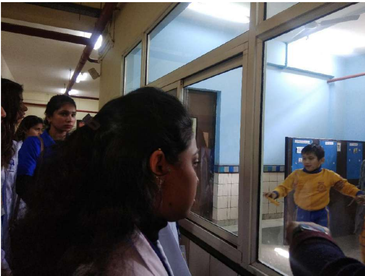
Hands on experience with children with special needs