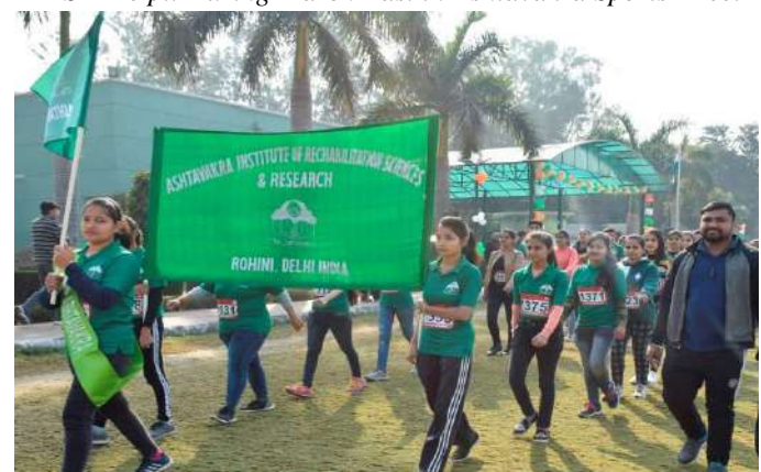
C.P Dept. During March Past in Ashtavakra Sports Meet 2020