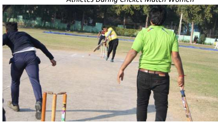
Athletes During Cricket Match Men