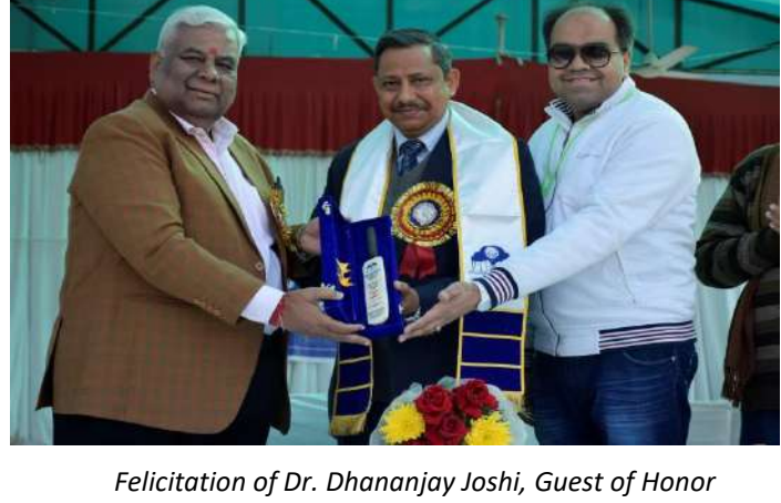
Dean, School of Education (GGSIPU)