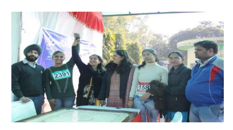
Winner Athletes of Carrom Finals Men