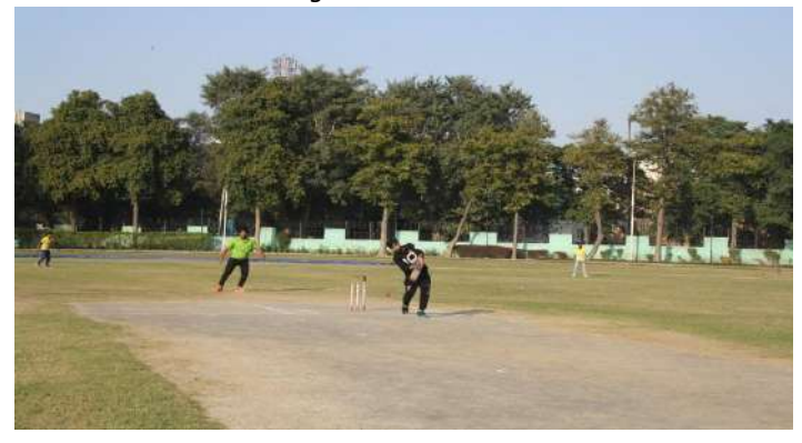
Athletes During Cricket Match Men