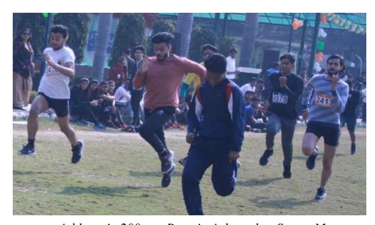
Athletes in 200 mts Race in Ashtavakra Sports Meet