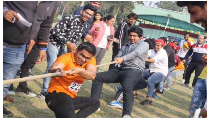
Athletes in Tug of War in Ashtavakra Sports Meet 2020