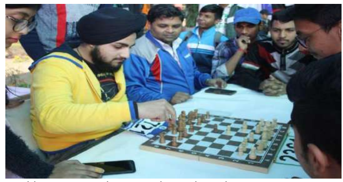
Athletes During Chess Match in Ashtavakra Sports Meet 2020