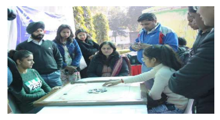
Athletes During Carrom Match in Ashtavakra Sports Meet 2020