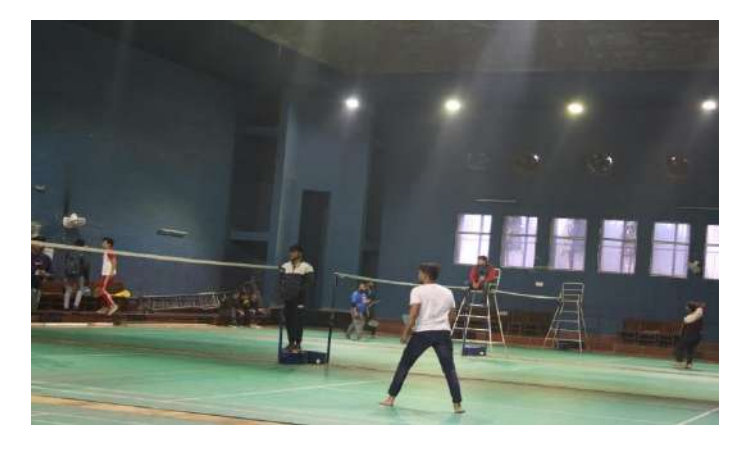
Athletes in Badmintion in Ashtavakra Sports