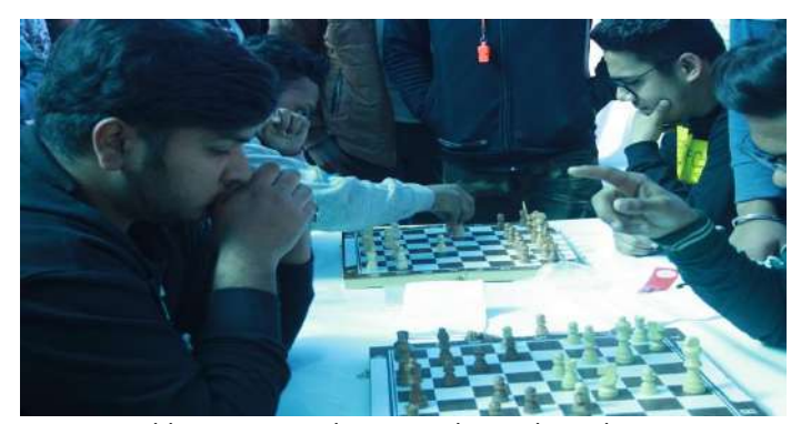
Athletes During Chess Match in Ashtavakra Sports