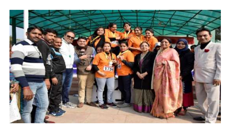
Award Ceremony of Ashtavakra Sports Meet 2020