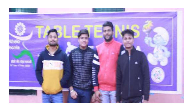
Winner Athletes of Tennis Finals Men