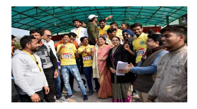
Award Ceremony of Ashtavakra Sports Meet 2020