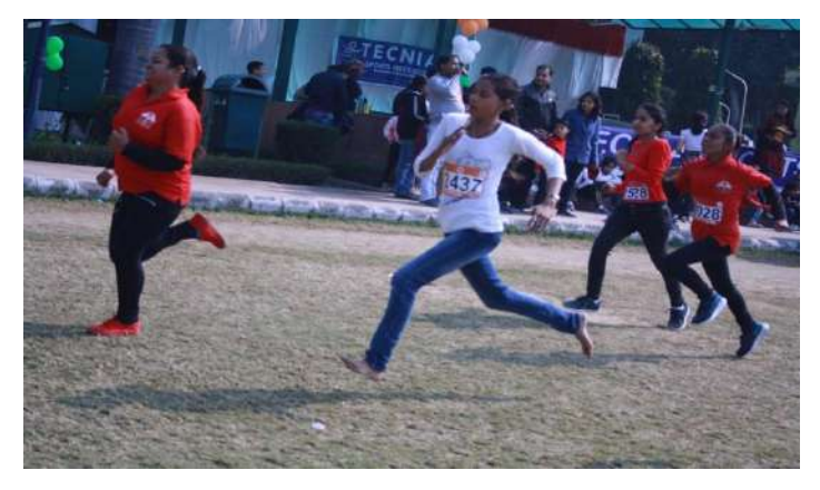
Athletes in 400 mts Race in Ashtavakra Sports Meet