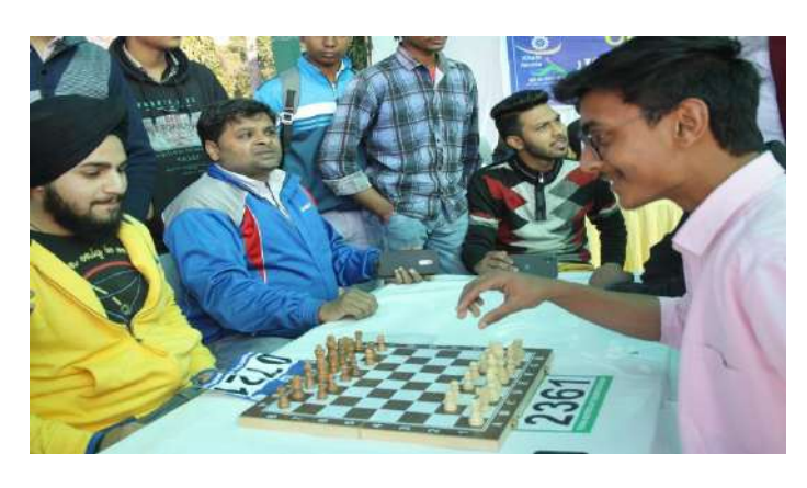
Athletes During Chess Match in Ashtavakra Sports Meet