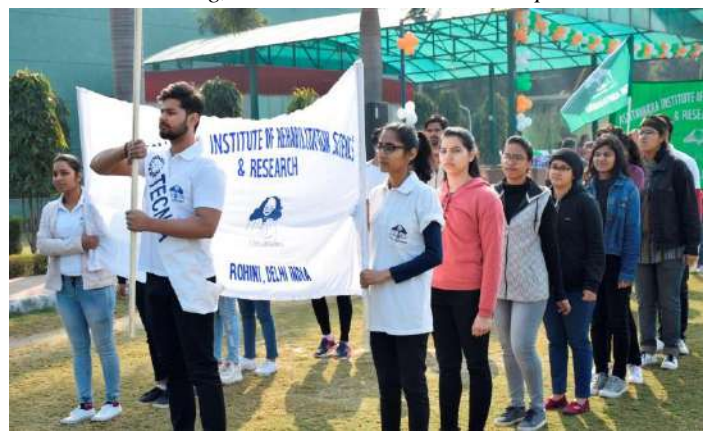
BASLP Dept. During March Past in Ashtavakra Sports Meet 2020