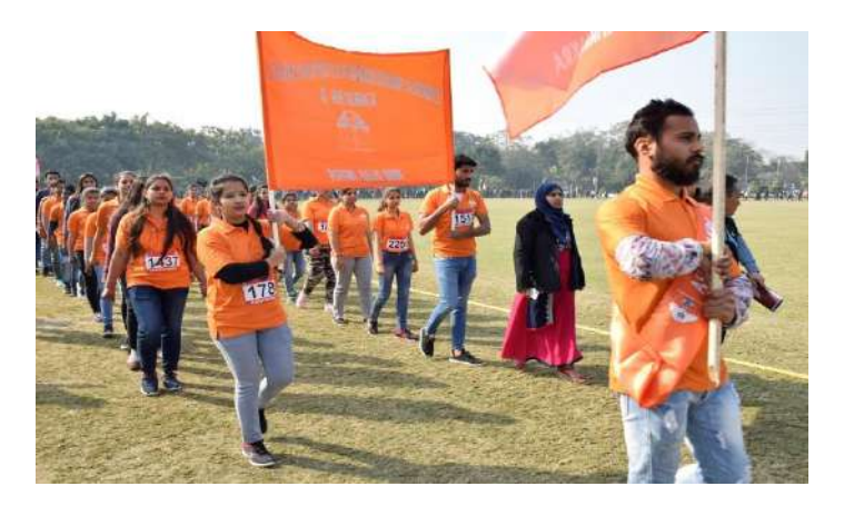
HI Dept. During March Past in Ashtavakra Sports Meet 2020