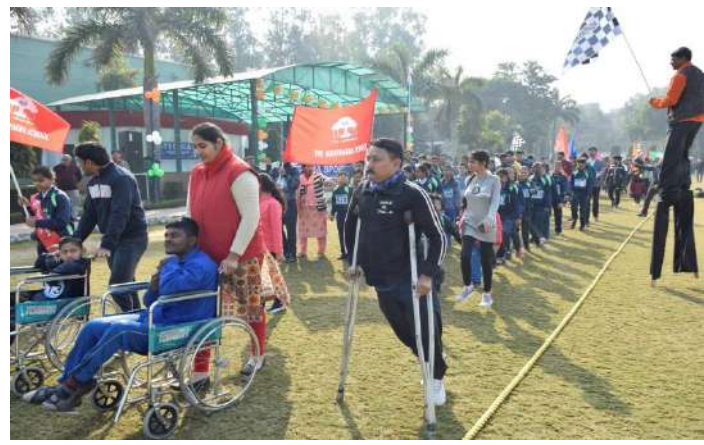
ASS Durning, March Past in Ashtavakra Sports Meet 2020