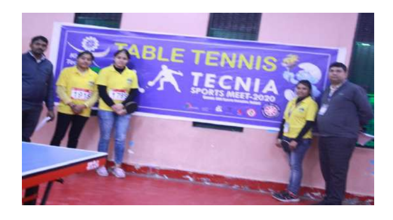
Winner Athletes of Table Tennis Finals Women

Athletes During Table Tennis Match in Ashtavakra Sports Meet 2020 Meet 2020