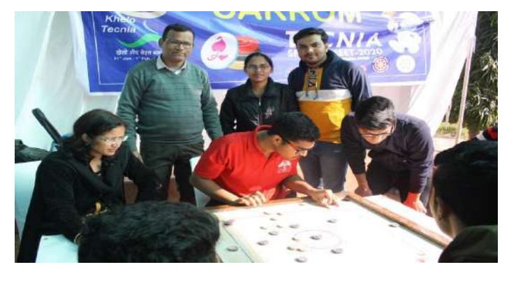
Athletes During Carrom Match in Ashtavakra Sports