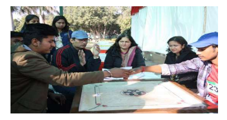
Athletes During Carrom Match in Ashtavakra Sports Meet 2020 Meet 2020