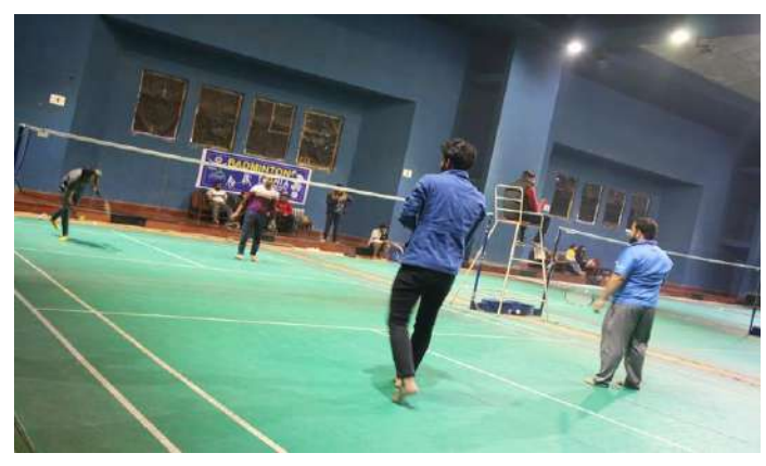
Athletes in Badmintiont in Ashtavakra Sports Meet 2020