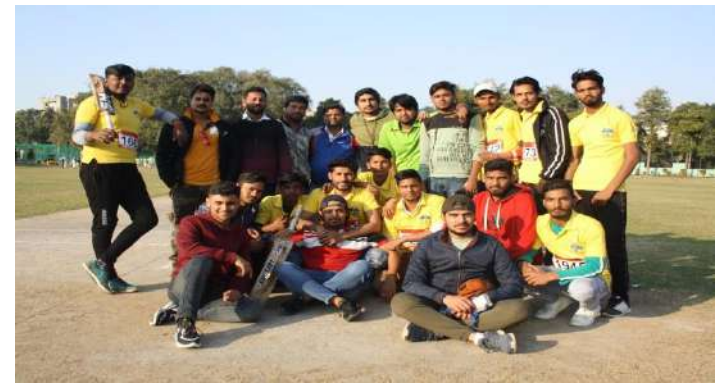
Winner Athletes of Cricket Finals Men in AIRSR Dept (DB)