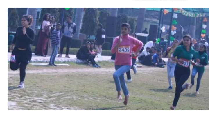
Athletes in 200 mts Race in Ashtavakra Sports