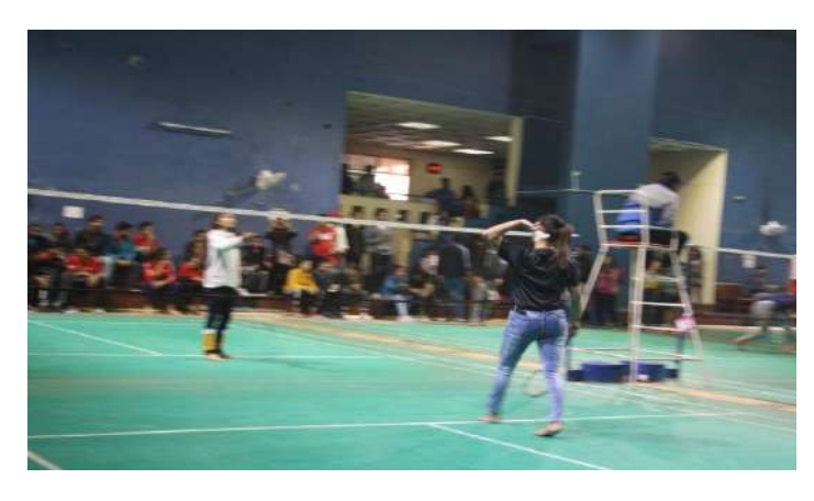
Athletes in Badmintiont in Ashtavakra Sports Meet 2020 Meet 2020