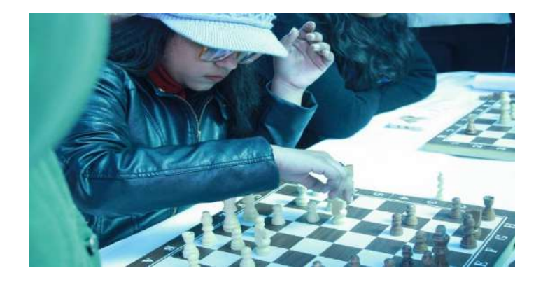
Athletes During Chess Match in Ashtavakra Sports