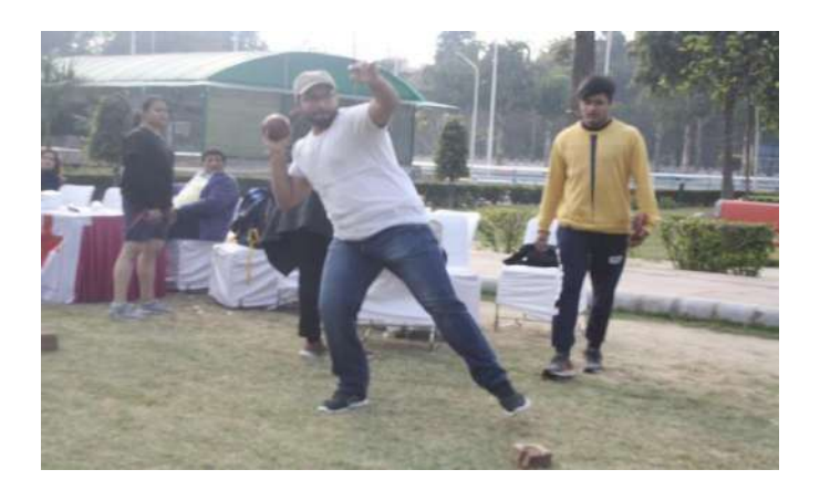
Athletes in Shot Put in Ashtavakra Sports Meet