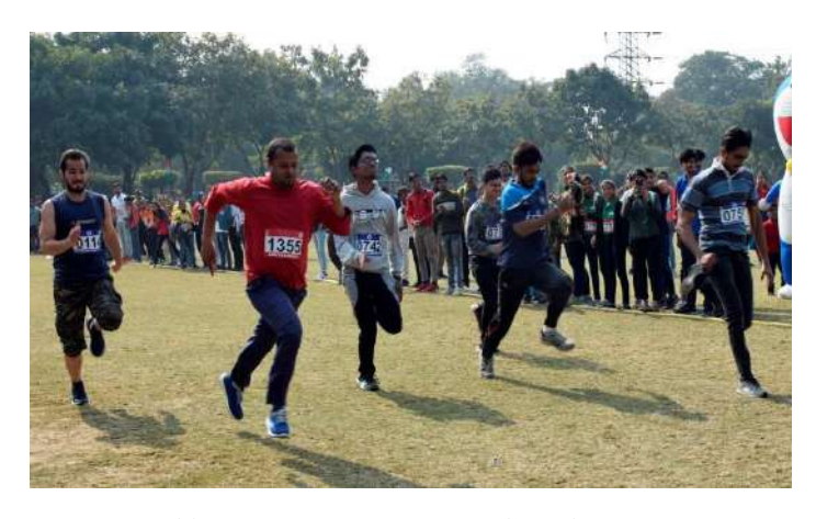
Athletes in 100 mts Race in Ashtavakra Sports Meet