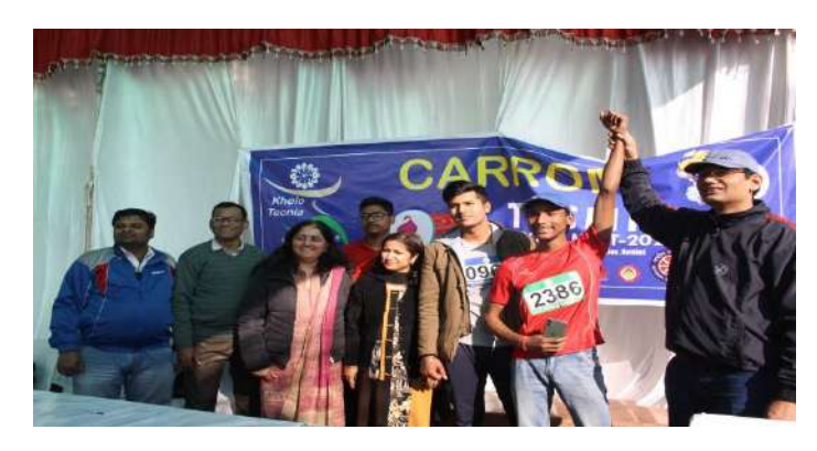
Winner Athletes of Carrom Finals Women