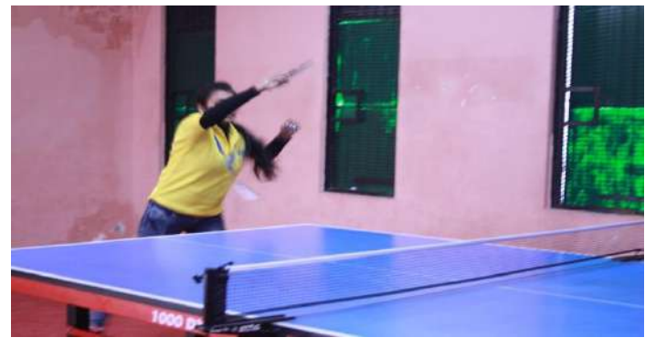
Athletes During Table Tennis Match in Ashtavakra Sports Meet 2020