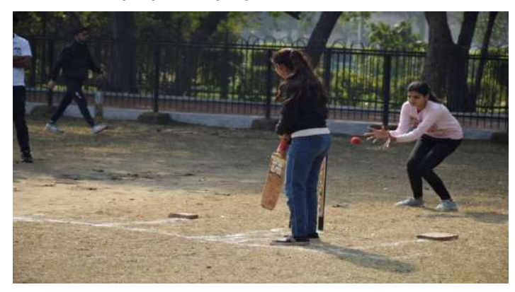
Athletes During Cricket Match Women