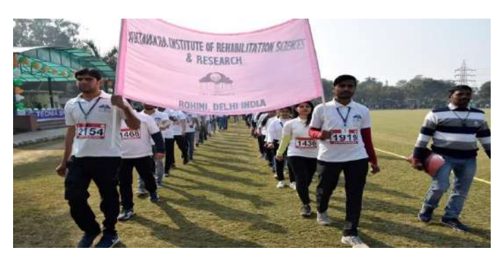
V.I Dept. During March Past in Ashtavakra Sports Meet