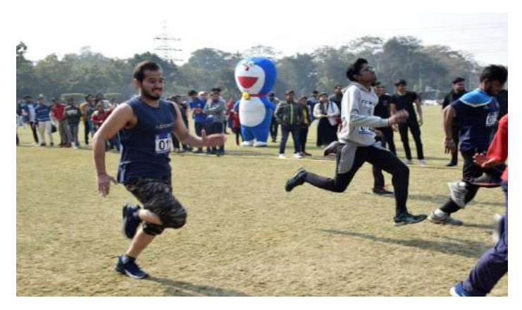
Athletes in 400 mts Race in Ashtavakra Sports Meet