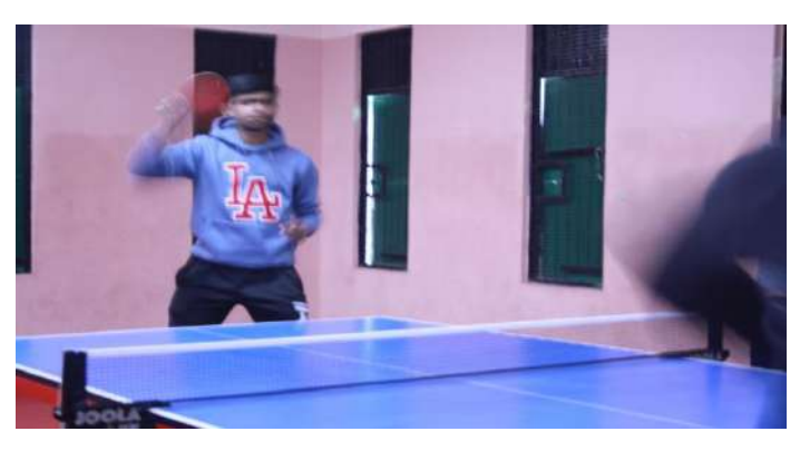
Athletes During Table Tennis Match in Ashtavakra Sports

Athletes During Table Tennis Match in Ashtavakra Sports Meet 2020 Meet 2020