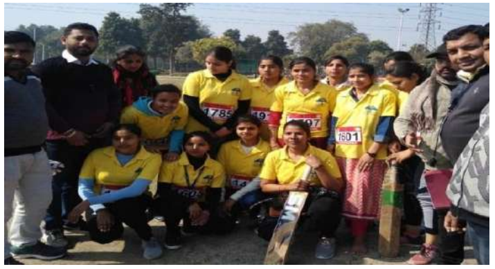
Winner Athletes of Cricket Finals Women in AIRSR Dept (DB)