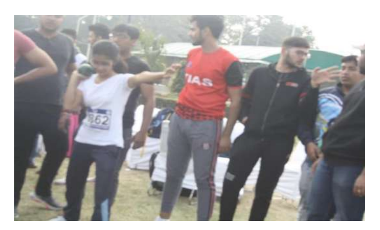
Athletes in Shot Put in Ashtavakra Sports Meet