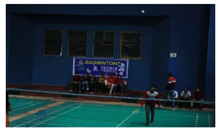
Athletes in Badmintion in Ashtavakra Sports Meet 2020