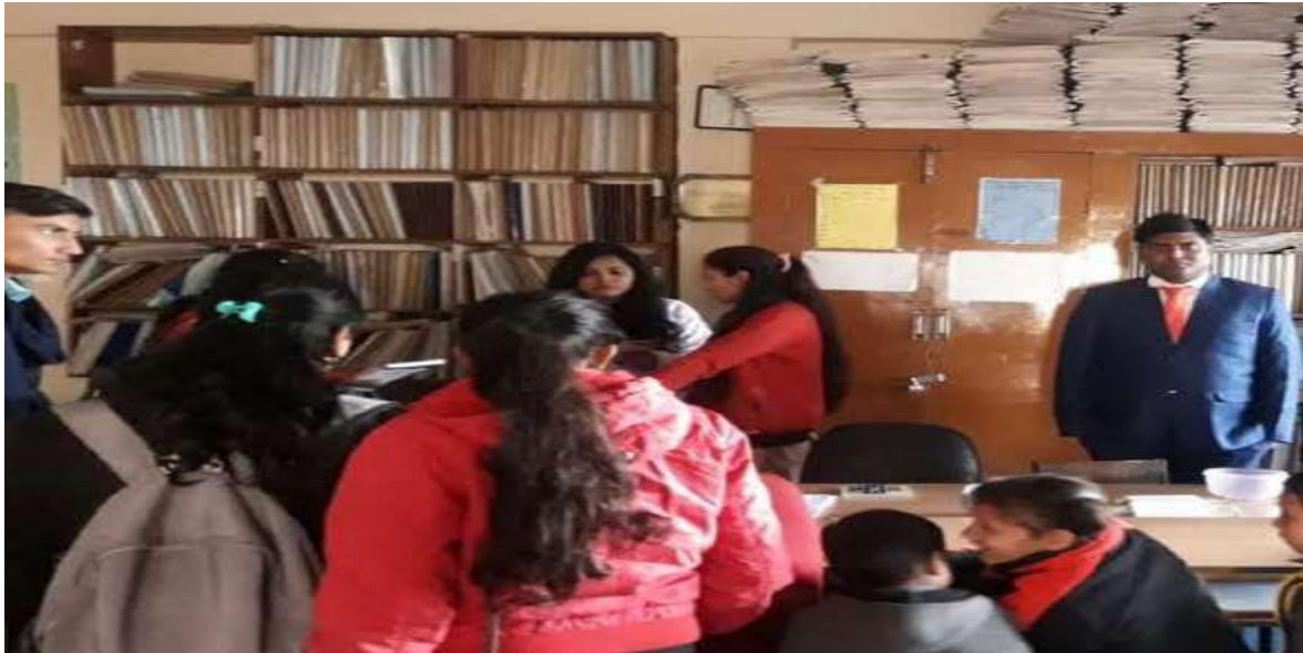
All students got Aware about the Setup of braille Library