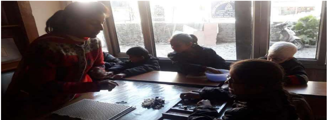
All students got Aware about the Play of Chess board