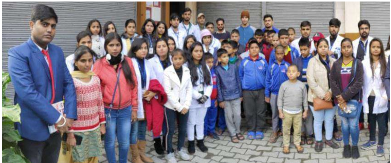
Group photo with Students NAB

The Group arrived at hotel in Manali Himanchal Pradesh at 05 AM on 25 th November 2019. After check-in, the students had breakfast and proceeded for an Educational Visit to NAB. At 8:30AM on 25 th Nov-2019