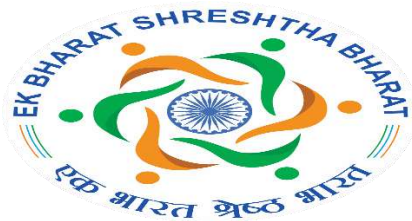
(LOGO-EK BHARAT SHRESHTHA BHARAT)