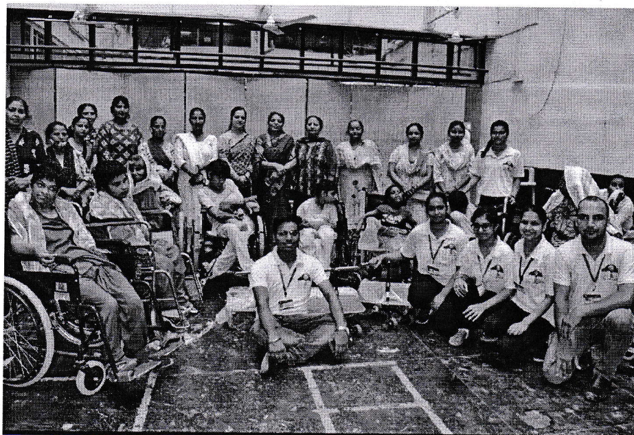
Group photograph of the beneficiaries with staff