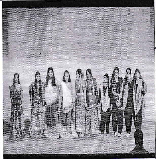
Dance performance by the students of Ashtavakra institute of Rehabilitation Sciences and Research and Tecnia Institute of Teacher Education

PSP Rohini Delhi-85 Ashtavakra Institute of Rehabilitation Sciences and Research Tecnia Institute of Teacher Education Signature