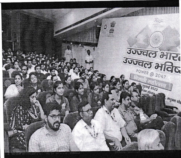
Glimpses of participants at Tecnia Auditorium