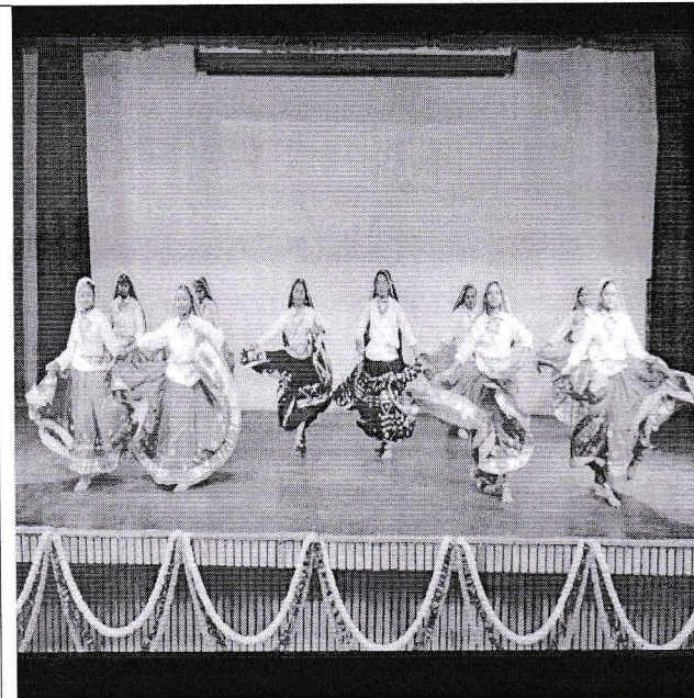
Dance performance by students of Sarvodaya Kanya Vidyalaya