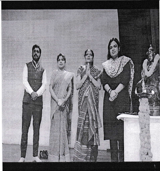
Evoking Gods presence by lamp Lighting