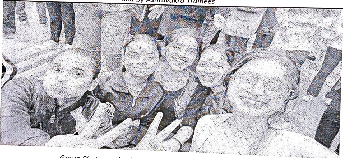
Group Photograph of the Ashtavakra School Students & Trainees