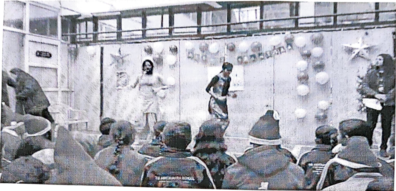
Skit by Ashtavakra Trainees