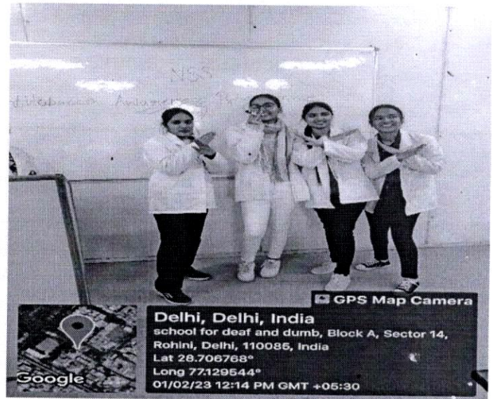
The students depicting ill effects of tobacco through play