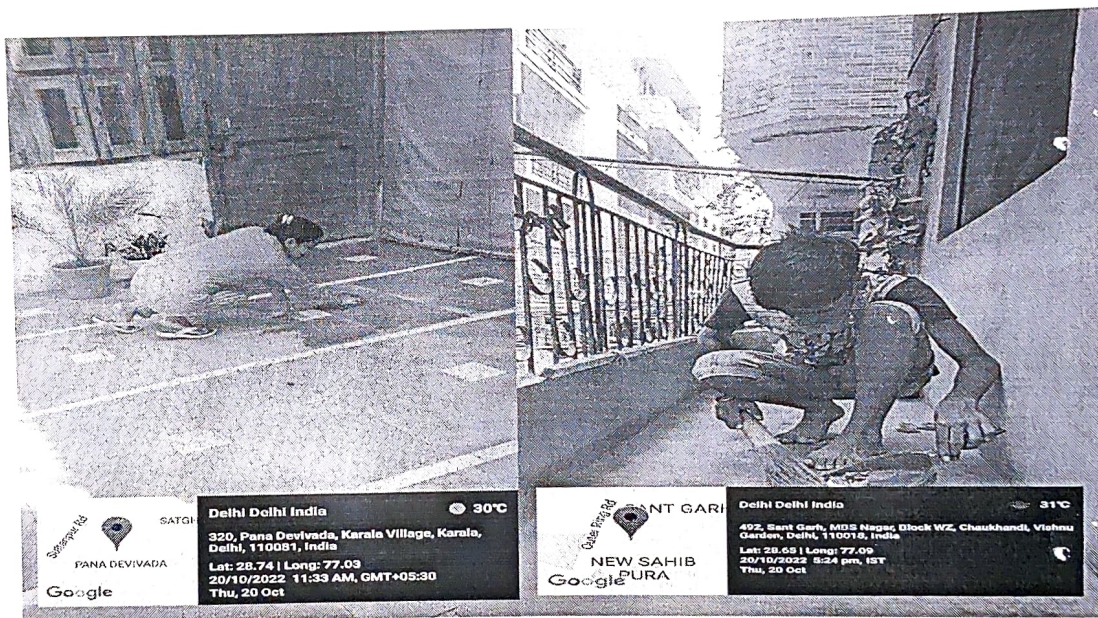
Encouraging general public to keep the society clean