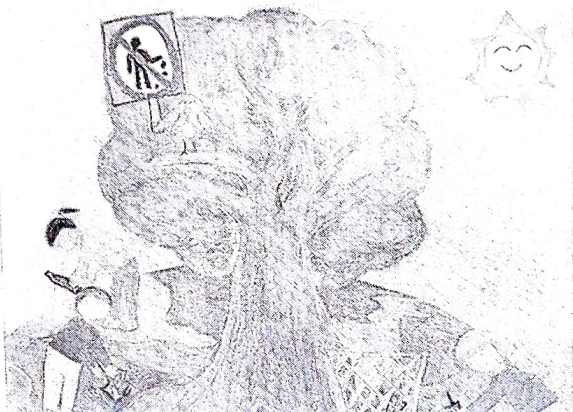
Encouraging general public to keep the society clean

New Delhi, DL, India Rohini Sector 24, New Delhi, 110085, DL, India Lat 28.730613, Long 77.088229 10/18/2022 02:02 PM GMT+05:30 Note : Captured by GPS Map Camera