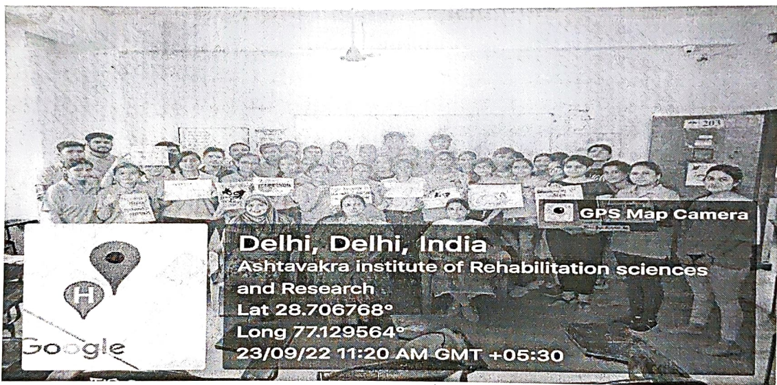
Student displaying their posters