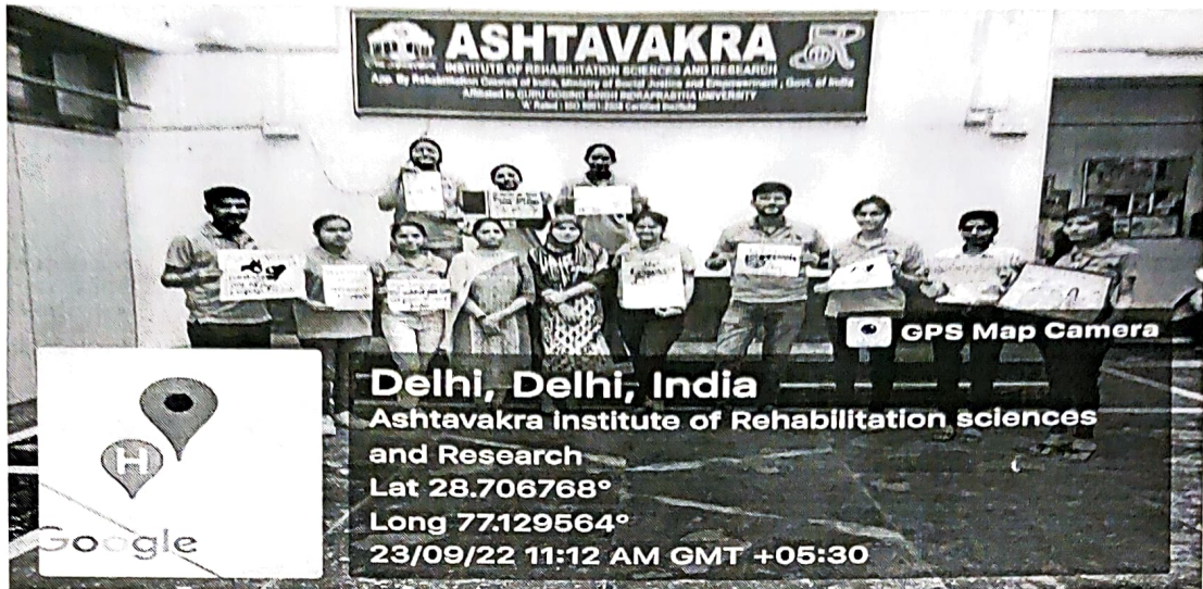
Dance performance by the student