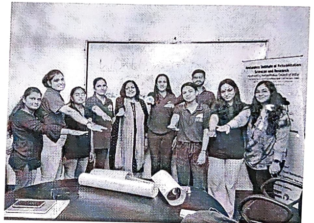
Display of posters and pledge by trainees