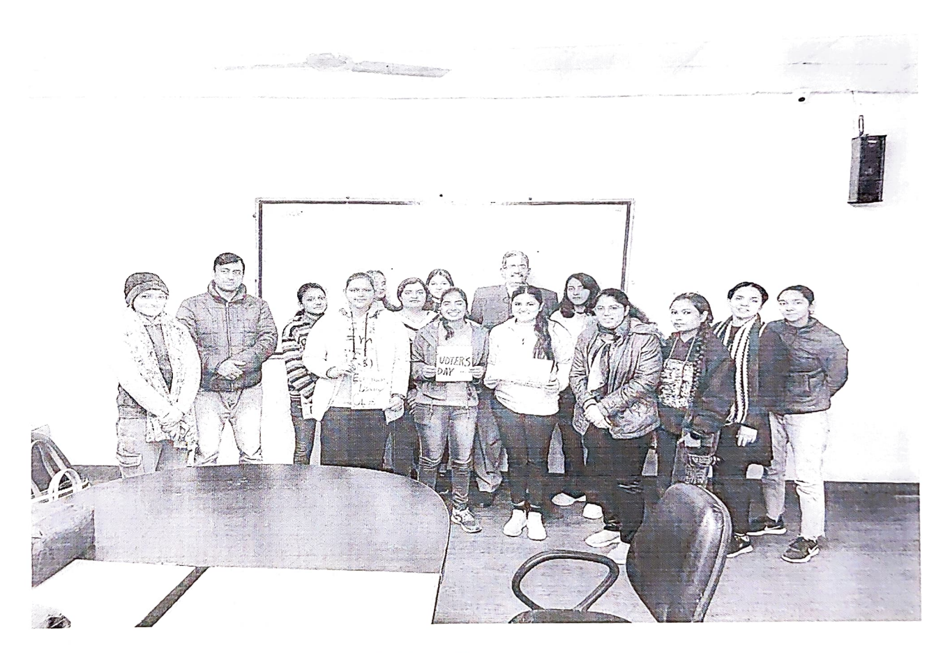
Address By Honourable Guest