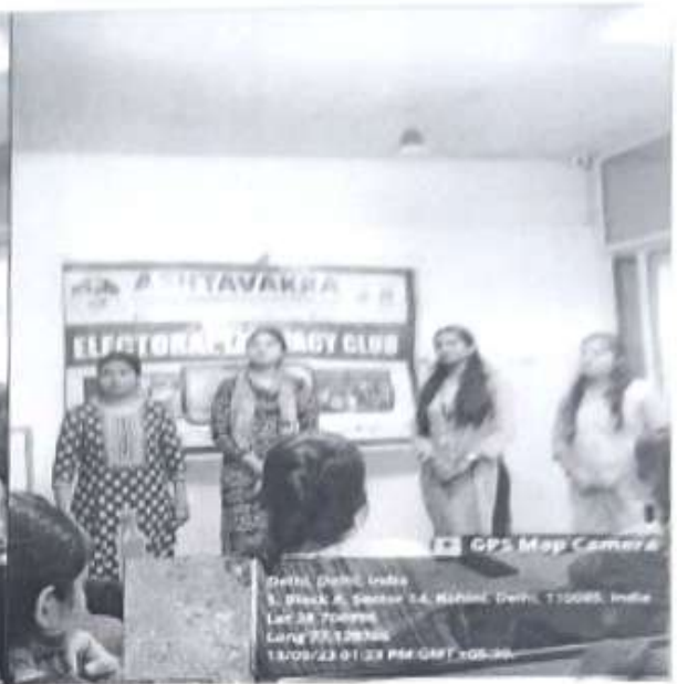
Mock presentation of Election