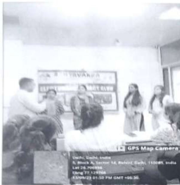
Mock presentation of Election