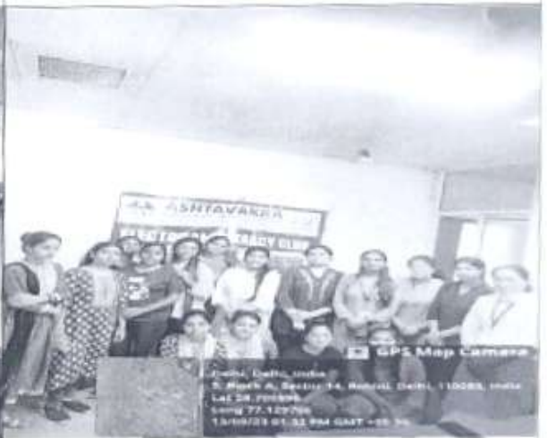
Awareness regarding Elections