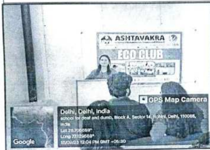
Presentation by AIRSR Student