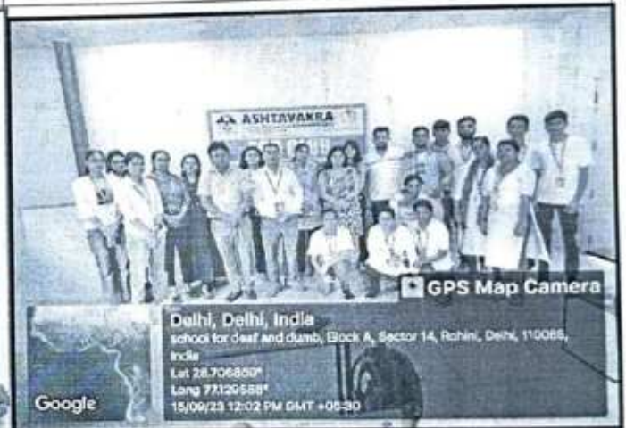
Awareness regarding Presevation of Ozone layer