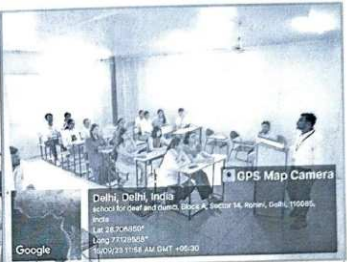
Awareness Regarding Presevation of Ozone Layer