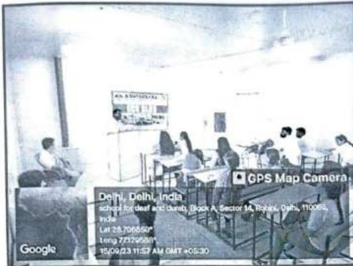
Introductory speech by Nodal Officer