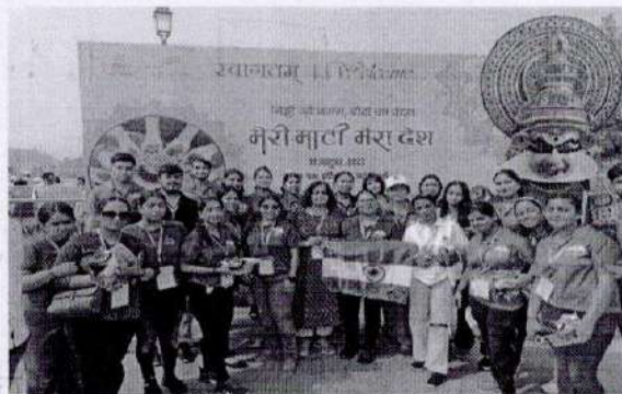
Volunteers along with NSS Officer giving tribute to National Flag