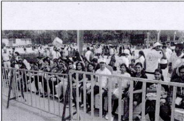
NSS volunteers participated in Vaedictory function of "Meri Maati Mera Desh"