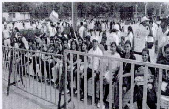
Volunteers attending Vaedictory Function

Report: Description in (min 250 to max 800 words)*