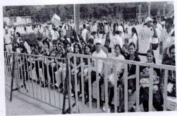
Volunteers attending Valedictory Function

Report: Description in (min 250 to max 800 words)*