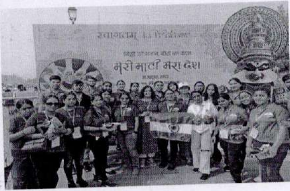
Volunteers along with NSS Officer giving tribute to National Flag