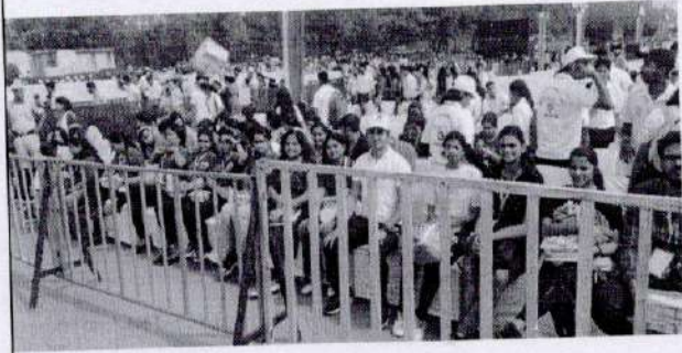
NSS volunteers participated in Valedictory function of "Meri Maati Mera Desh"