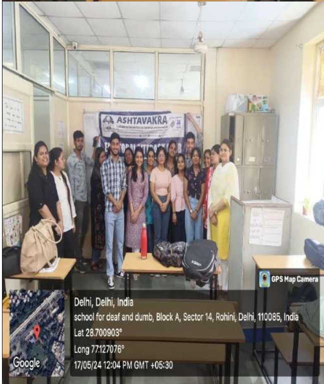
Delhi, Delhi, India school for deaf and dumb, Block A, Sector 14, Rohini, Delhi, 110085, India Lat 28.700903° Long 77.127076° 17/05/24 12:04 PM GMT +05:30