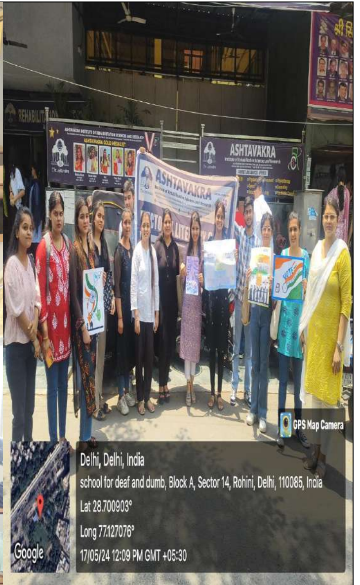
Delhi, Delhi, India school for deaf and dumb, Block A, Sector 14, Rohini, Delhi, 110085, India Lat 28.700903° Long 77.127076° 17/05/24 12:09 PM GMT +05:30