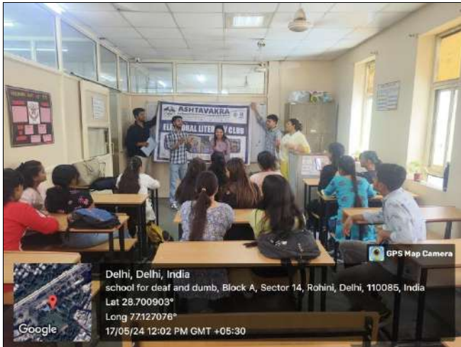
Delhi, Delhi, India school for deaf and dumb, Block A, Sector 14, Rohini, Delhi, 110085, India Lat 28.700903° Long 77.127076° 17/05/24 12:02 PM GMT +05:30