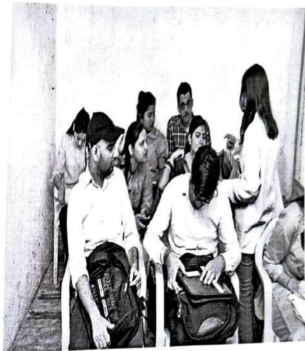
Students are waiting for Interview