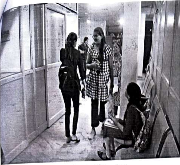
Students are waiting for Interview