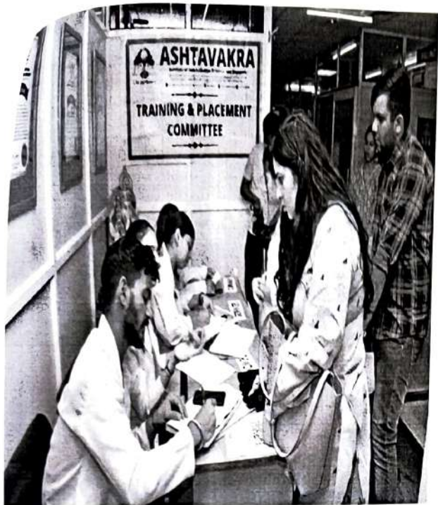
Registration for the Interview