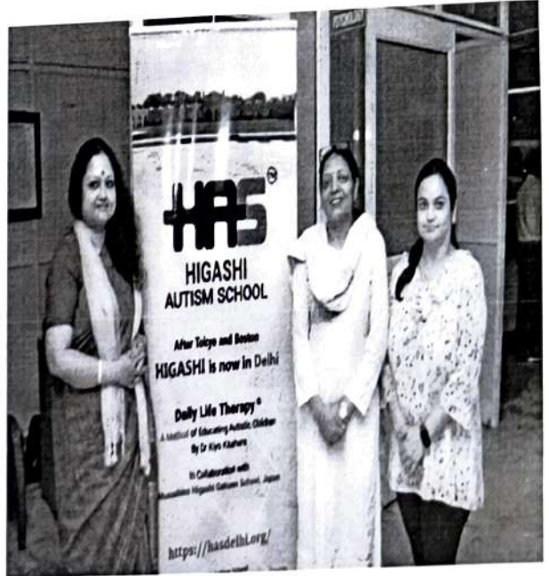
Felicitation of School