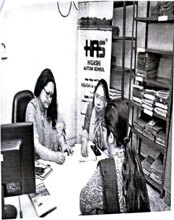
Clinics/Schools are Taking Interviews