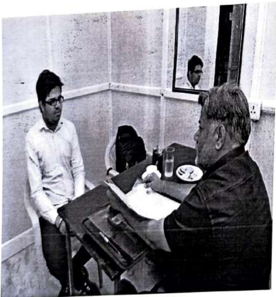
Clinics/Schools are Taking Interviews