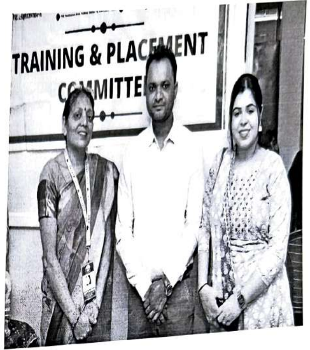
Felicitation of the Schools & Clinics members