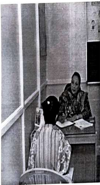
Clinics/Schools are Taking Interviews

Venue: Ashtavakra Institute of Rehabilitation Sciences & Research PSP Institutional Area, Sector-14, Maduban Chowk, Rohini, Delhi-110085