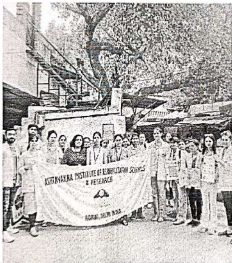
Engagement of staff & Students in the Awareness Programme.