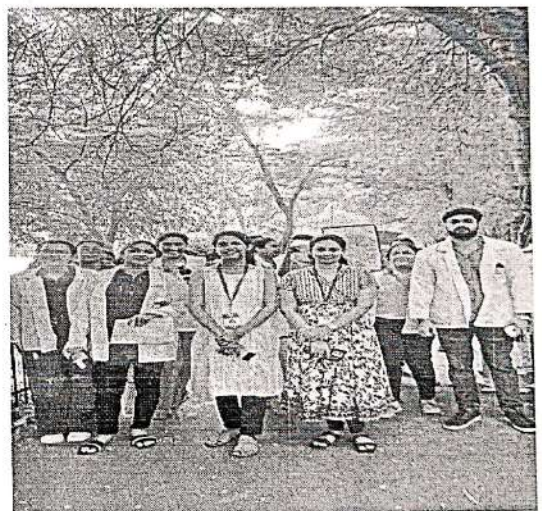
Empowered individuals by providing them with the knowledge, skills, and confidence to pursue their goals and aspirations