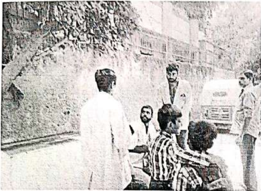
Raising awareness about Education & Skill Devp.