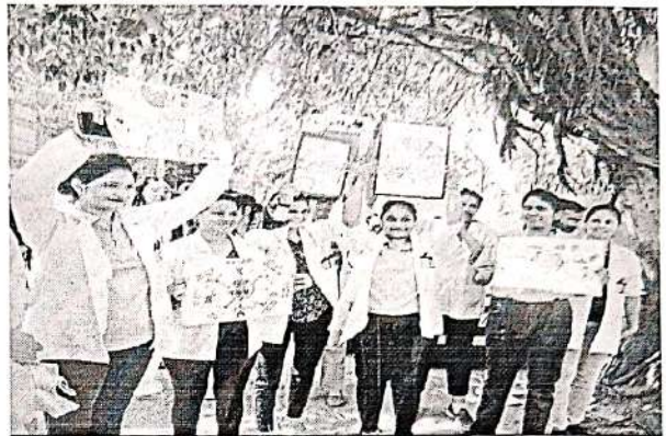
Posters representing Educational Opportunities