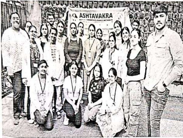
Photograph of the Event with the Caption