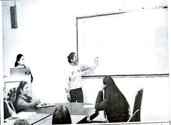
Ena students of B.Ed.SE.ID explaining renewable energies like solar energy, biofuels to cut down fossil fuel use.