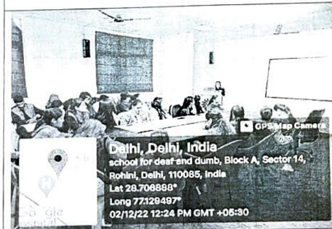
Poster Making Competition by B.Ed.SE.ASD/LD/HI/VI/ID on the occasion of "National Pollution Prevention Day"

Delhi, Delhi, India school for deaf and dumb, Block A, Sector 14, Rohini, Delhi, 110085, India Lat 28.706888° Long 77.129497° 02/12/22 12:24 PM GMT +05:30