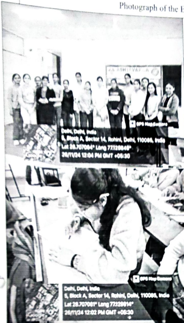
Photograph of the Event with the Caption